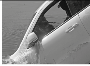
Durango in the Canal, 2011 Dye sublimation print 127 x 182.88 cm