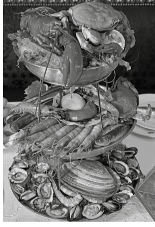
Seafood Tower at the Corner Bar for Gohar World, 2023 Dye sublimation print 91.44 x 60.96 cm