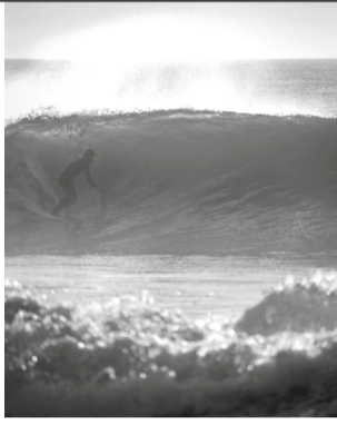
Rockaway (90th St), 2008 Dye sublimation print 152.4 x 101.6 cm