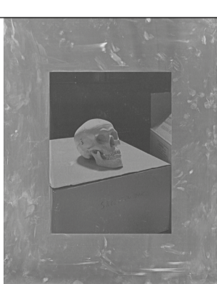
Skull on Brass, 2017 UV print on brass 76.2 x 61 cm