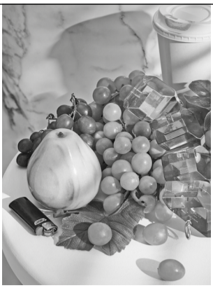
Celine Bracelet for Gentlewoman, 2014 Dye sublimation print 76.2 x 61 cm