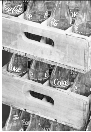
Coke Bottles, 2015 Dye sublimation print 124.46 x 83.82 cm