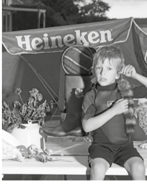
Auggie with Raccoon Tail, 2015 Dye sublimation print 127 x 101.6 cm