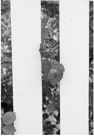
Picket Fence I, 2017 Dye sublimation print 124.46 x 83.82 cm