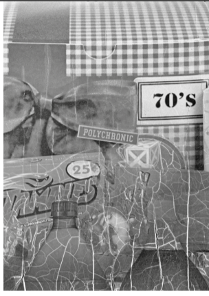
Polychronic Sticker on Window Decal, 2023 Dye sublimation print 81.3 x 61 cm