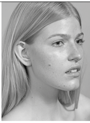
Louise, 2014 Dye sublimation print 76.2 x 61 cm