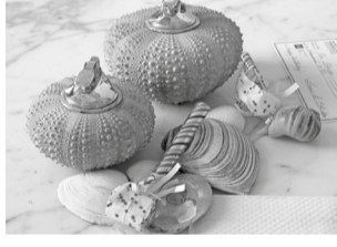
Birthday Still Life, 2023 Dye sublimation print 61 x 76.2 cm