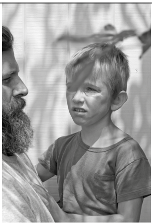
Me and Auggie, 2015 Dye sublimation print 124.46 x 83.82 cm