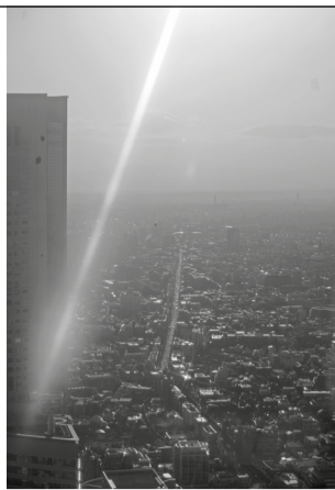
Tokyo 2, 2009 C-print 152.4 x 101.6 cm