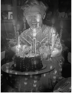
Birthday Multiply, 2021 Dye sublimation print 70.2 x 61 cm