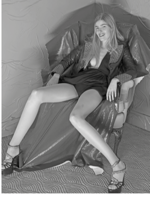
Louise in a Chair for Double, 2015 Dye sublimation print 134.62 x 101.6 cm