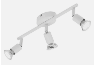
Light Fixture, 2021 Dye cut vinyl 121.9 x 182.9 cm