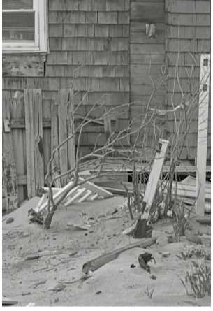
Backyard, Rockaway Beach, April 12, 2013 Dye sublimation print 124.46 x 83.82 cm