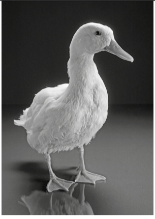
Duck for Burberry, 2023 Dye sublimation print 127 x 101.6 cm