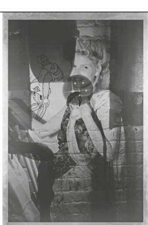
Louise on Brass #7, 2017 UV print on brass 182.9 x 121.9 cm