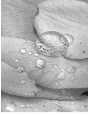
Double Dogwood with Dew Drops, 2021 Dye sublimation print 81.3 x 61 cm