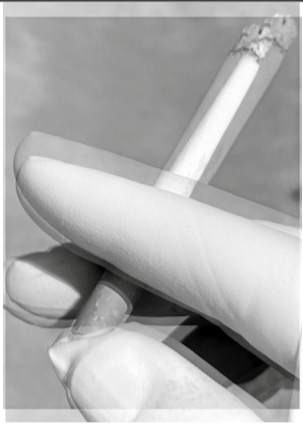
Double Latex Glove and American Spirit, 2023 Dye sublimation print 81.3 x 61 cm