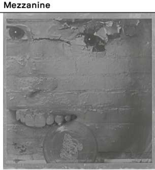
Louise on Brass #5, 2017 UV print on brass 121.9 x 121.9 cm