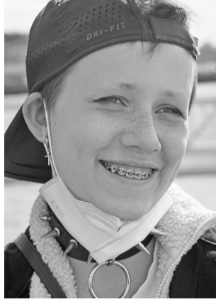
Lee Lou at Sunset Park Ferry Terminal, 2021 Dye sublimation print 91.5 x 61 cm