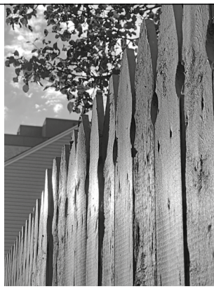
Nearest Neighbor, 2023 Dye sublimation print 81.3 x 61 cm