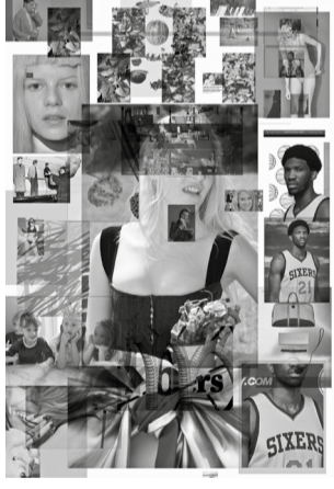
Pic 'n Clip 3, 2017 Dye sublimation print 182.88 x 121.92 cm Collection Mo & Hilary Koyfman